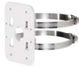
PFA152 Pole mount